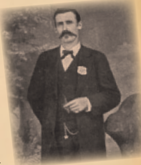
D. Stoudenmire, El Paso, Texas.

TO CARRY TWO GUNS YOU GENERALLY need two holsters. Most Old West historians will note that rarely did a lawman or an outlaw wear two gun belts, it's more of a western cinematic cliché, but that's not to say Sheriffs, Marshals, and lawmen of all stripes never strapped on a brace of guns; most did, with one usually having a shorter barrel for close up work and a second longer barreled six-shooter for distance. Short guns ended up in a pocket, a shoulder holster (by the 1890s), a custom belt holster, but mostly just tucked into a pant's waist. Legendary El Paso, Texas, City Marshall Dallas Stoudenmire carried a short-barreled Colt