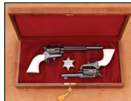
The Pietta Lawman set can be ordered with a burgundy velvet-lined presentation case.

I can remember when F.lli Pietta (F.lli is the abbreviation for Fratelli "brothers") started manufacturing Colt-style SAA revolvers in 2002, they were not this well refined or accurate. In less than a decade the company has improved fit and finish (polishing and bluing techniques), metal-