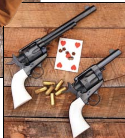
(Below) A John Wesley Hardin moment during the gun test resulted in this nicely perforated five of hearts shot from 33 feet with the 7.5" SAA and Ten-X 200-gr. RNFP .45 Colt.