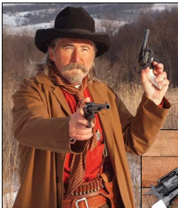
(Left) The new Pietta Lawman set provides a matched pair of high-polish all blue/black finished SAAs with white Micarta grips. The guns come out of the box with factory-tuned actions.